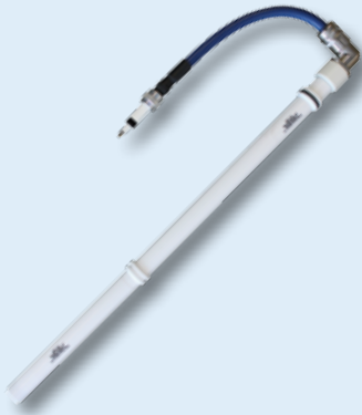
06.85.881 for Rolls Royce®