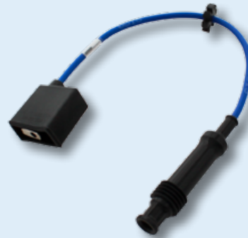
06.85.459 for Jinan® 12V190