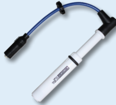
06.85.179-20 for Deutz®/ MWM® TBG620